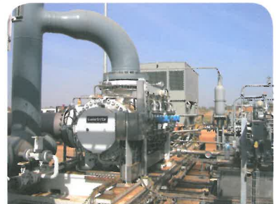
Figure 2. Leistriz twin screw pump in pipeline service.

In the not too distant past, heavy crude oil was recognised as uneconomical to produce and transport. These heavy crudes required unique production, transportation and processing technologies that were at the time considered pioneering. Today, that is not the case. Heavy oil producers operating in the harsh